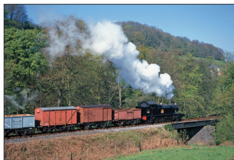
West Somerset Railway Association-owned Prairie No. 4561, on loan to the SDR in 1998, with a photo charter recreation of the Ashburton branch goods on 1 May 1998.