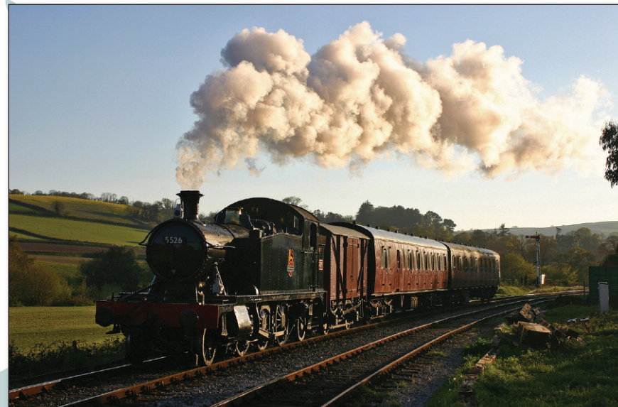
The South Devon Railway completed the restoration of Small Prairie No. 5526 on behalf of the owning group and the engine is now based on the line. Here the BR Black-liveried engine heads a local train through Bishops Bridge on the evening of 24 March 2004.