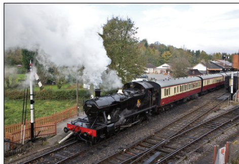
A damp autumn morning at Buckfastleigh as No. 5526 leaves with the red and cream set on 1 November 2008.