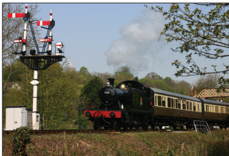
No. 5526 shunts stock ready for the morning's departure at Buckfastleigh on 25 April 2004.