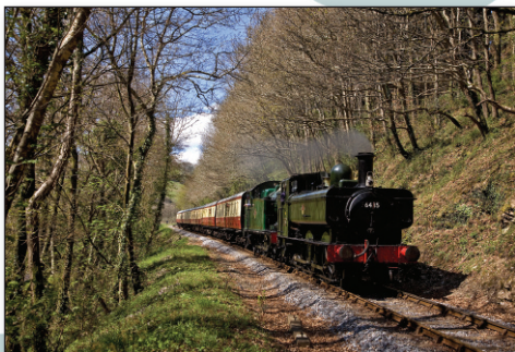
Pannier No. 6435 & GW 0-6-2T No. 6695 head through dappled light at Riverford Woods on 12 April 2009.