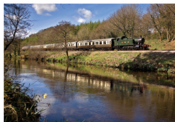
Left A rather dull morning sees Prairie No. 5526 as it heads a single Guller coach alongside the river at Hood Bridge forming an early morning Tynes to Buckfastleigh service on 24 March 2008.