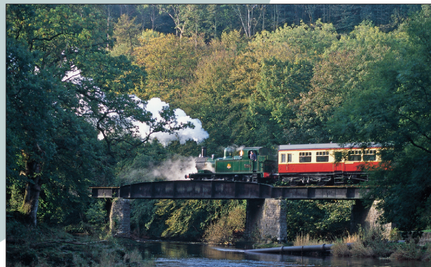
Before the bridge was modernised in order to allow locomotives with higher axle weights to cross, the bridge over the River Dart at Nursery Pool near Buckfastleigh was a real classic photo location. Here a timeless scene is recreated as 0-4-2T No. 1466, on loan from the Great Western Society at Didcot, propels an autococh across the bridge amid autumn hues in October 1995.